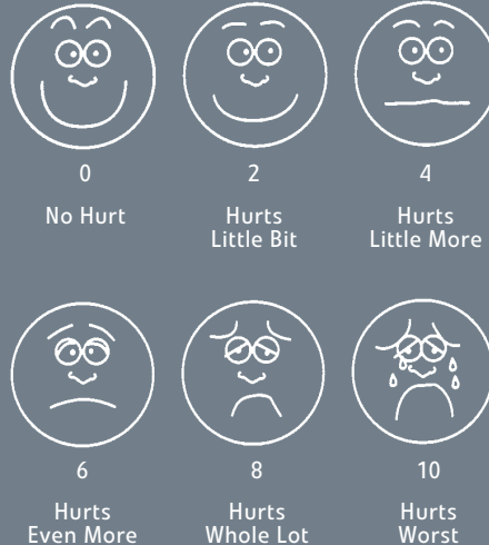
*Wong-Baker Pain Rating Scale